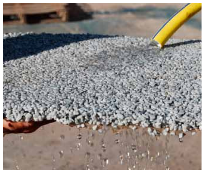
RAIN WATER ABSORPTION