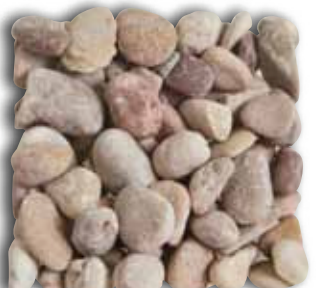
ARIDO RIO 8/12