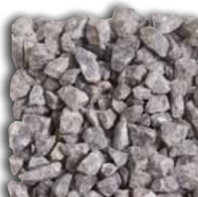
GRIS MACAEL 5/9